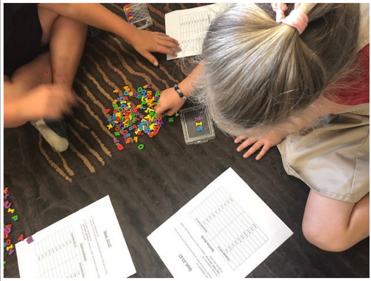
Students using mini erasers to practice spelling words.