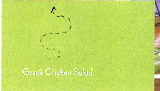
Greek Chicken Salad